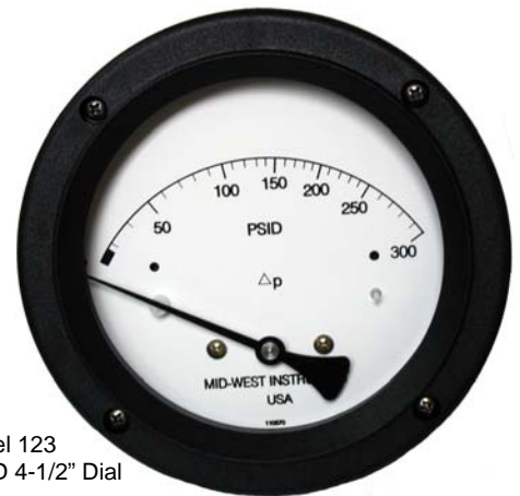
Model 123 0-300 PSID 4-1/2" Dial

An optional maximum indication follower pointer provides automatic indication of maximum differential occurring during a time period or system cycle. Reversed pressure ports are optionally available to facilitate installation and readability depending on which side of a filter, etc., the instrument must be installed.