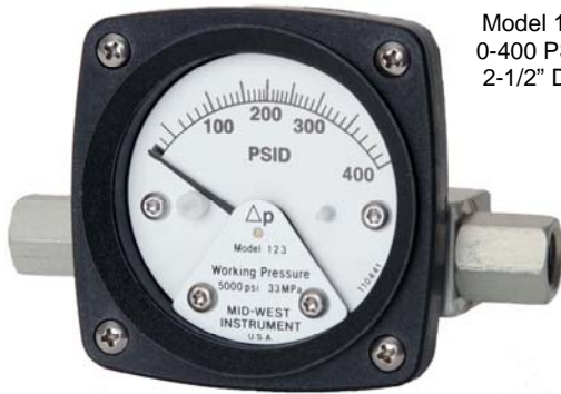
Model 123 0-400 PSID 2-1/2" Dial

A low cost differential pressure gauge for use in measuring the pressure drop across filters, strainers, separators, valves, pumps, chillers, etc., and for local flow indication and control.