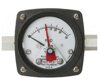
Model 122 0-30 PSID 2-1/2" Dial w/Maximum Follower Pointer

Due to precision sizing of piston and body bore, leakage across piston will not exceed 15 SCFH air at 100 PSID at ambient temperature.